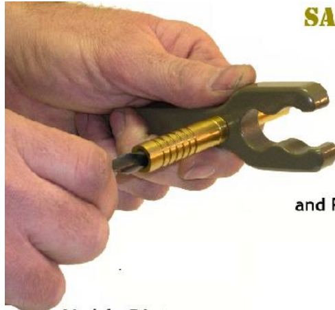
Holds Piston when Cleaning

SADLAK INDUSTRIES LLC Precision M14 Parts