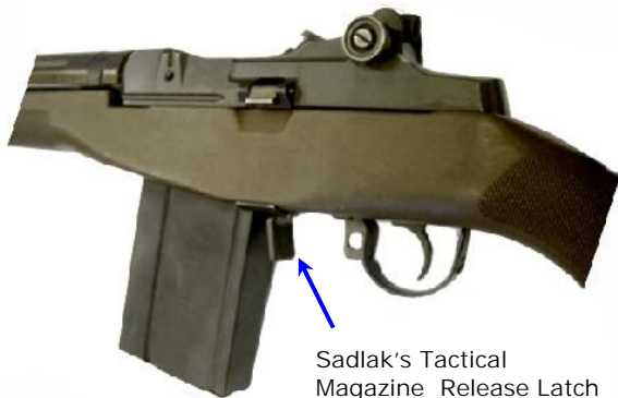
Sadlak's Tactical Magazine Release Latch

The case-hardened steel has a hardness of 55 Rc and a mil-spec parkerized finish.