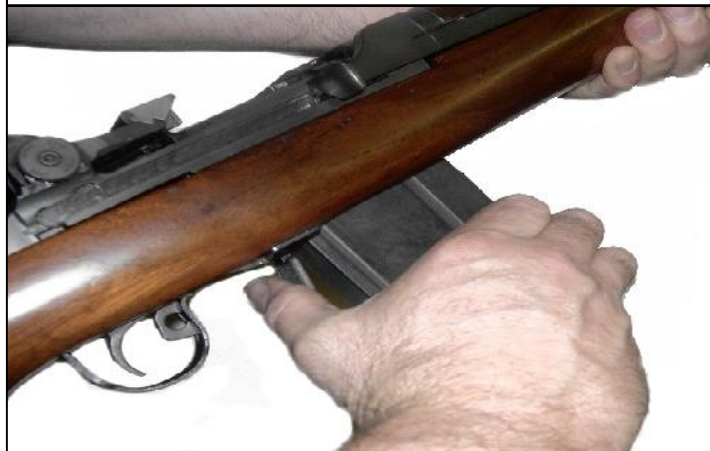
Sadlak's Tactical Magazine Release Latch with Thumb Tab Approximately 2-1/2 Times Larger Than Standard USGI