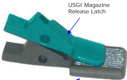
USGI Magazine Release Latch

The ergonomic design of the rounded edges assure comfortable use.