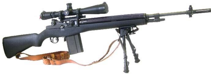
M14 shown with (#7) Harris Bi-Pod and (#8) Turner NM Leather Sling Attached to Sadlak Reinforced QD Post #140050