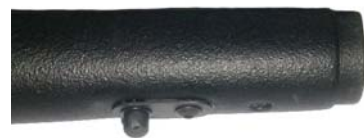
Reinforced QD Post Assembly bedded to Black Fiberglass Springfield Armory Inc. Stock