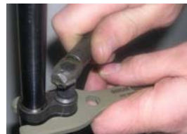
Steel Wrench (1/4 thk.) being used to hold gas cylinder body while removing gas plug nut with USGI issued 3/8 hex combo tool (Sold separately).

Alum.Wrench (1/2 thk.) in use holding the piston in its D-shaped hole to prevent the piston from rotating during cleaning of internal carbon deposits.