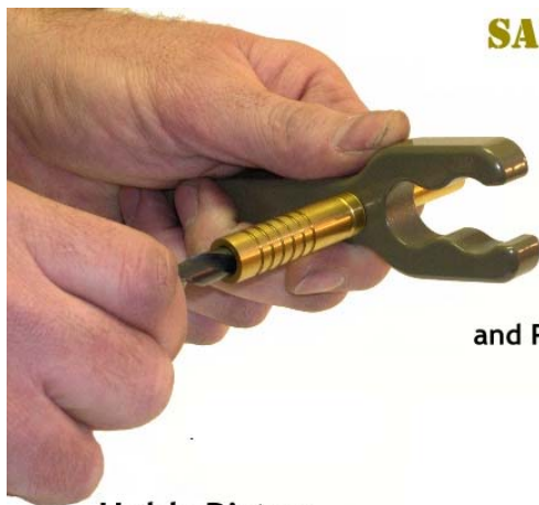
Holds Piston when Cleaning

Comfortably holds Gas Cylinder and Piston for Service and Maintenance