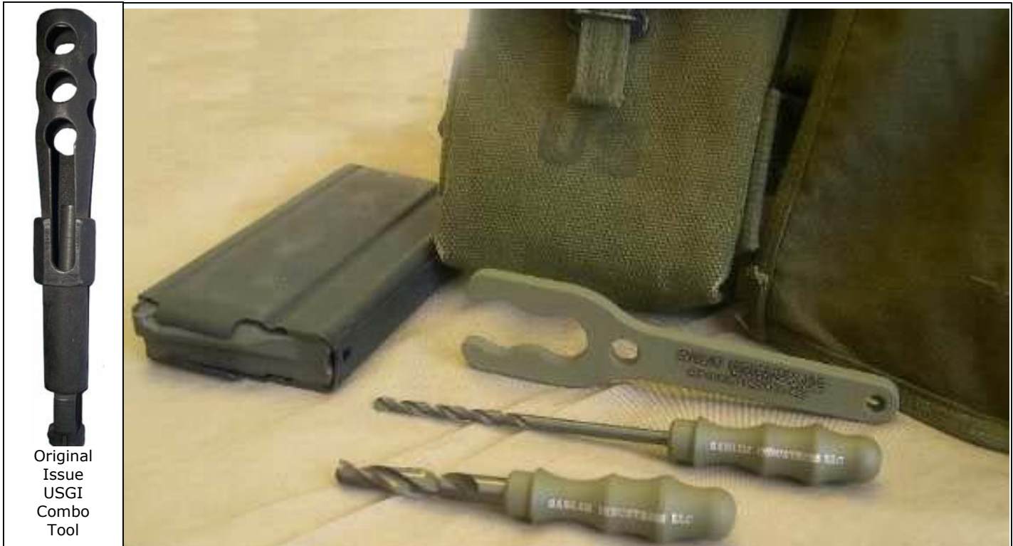
Original Issue USGI Combo Tool