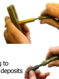
Cleaning drill #15 shown cleaning a TiN coated piston.

Alum.Wrench (1/2 thk.) in use holding the piston in its D-shaped hole to prevent the piston from rotating during cleaning of internal carbon deposits.