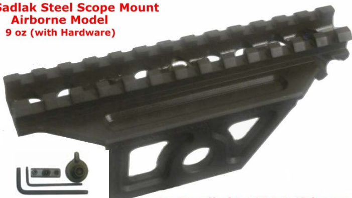
Sadlak Steel Scope Mount Airborne Model 9 oz (with Hardware)